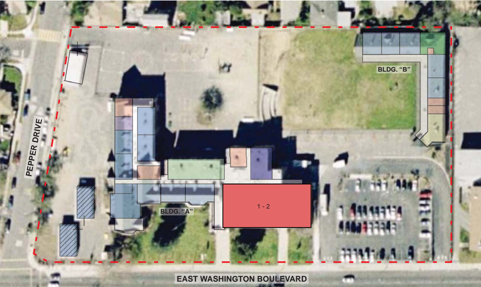
SITE SIZE : 4.80 ACRES