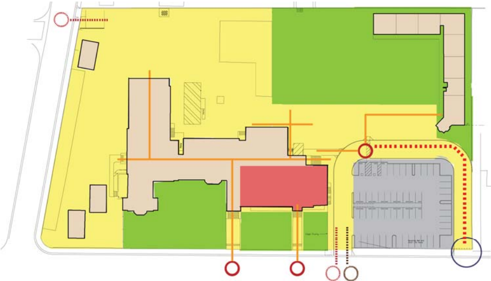
SITE CHARACTERISTIC MAP